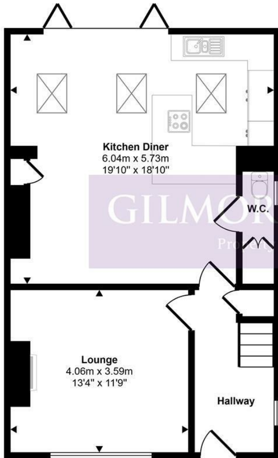
Ground Floor Approx 58 sq m / 619 sq ft

Approx Gross Internal Area 98 sq m / 1057 sq ft